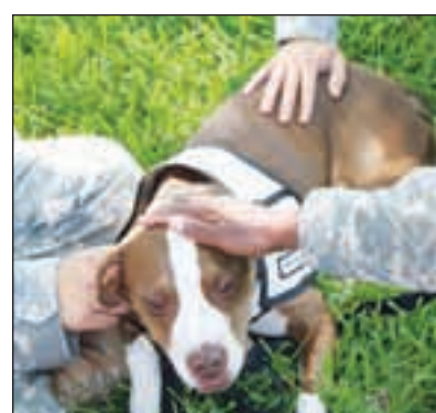
While Mocha does her duties as a therapy dog, she's also working toward changing public perception of pit bulls.

only way out is through. The dogs don't help them necessarily escape their problems, but they help them